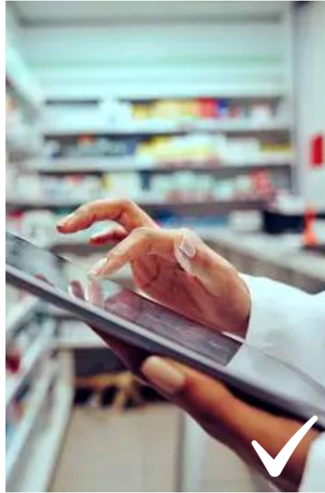
Safety and data quality