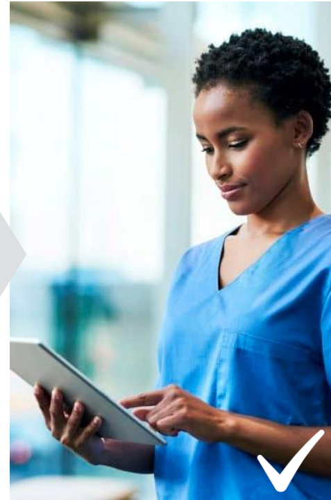
Integration and shared care records