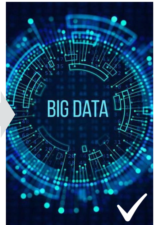
Innovation, insight and prevention

Being sure of conformance is not an option, it's essential!