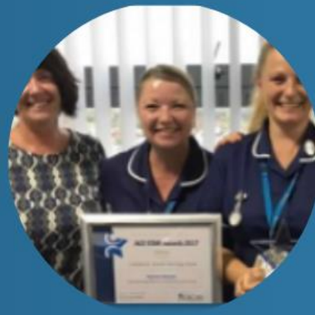
Colchester North Team winner at ACE STAR Awards for the work on the Malinko Pilot