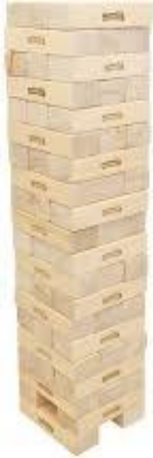
Single Stack EPR